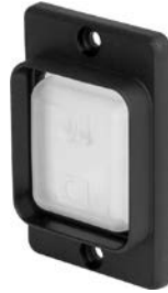
Screw-on collar with cover 2-pole, CZZ21