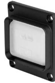
Screw-on collar with cover 3-pole, CZZ31